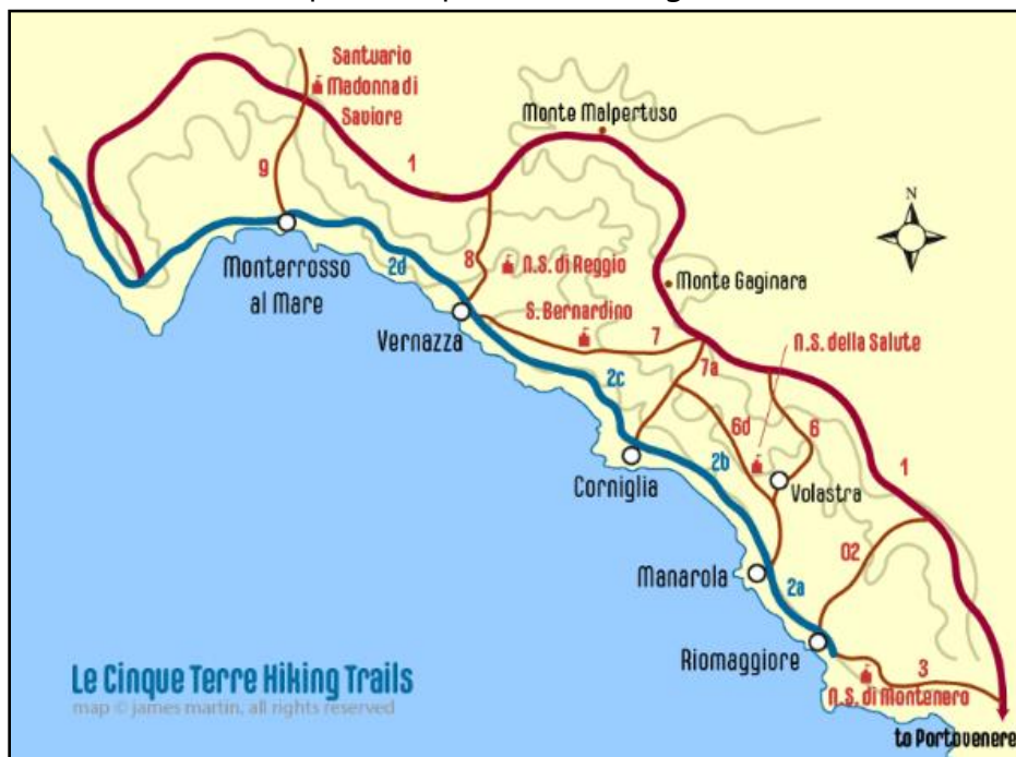
Map of Cinque Terre Hiking Trails

The Tower of the Doria Castle, built in the 15 th century to protect the village from pirates, is located above the bay and the small port